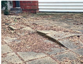
Uneven driveway paving, tripping hazard