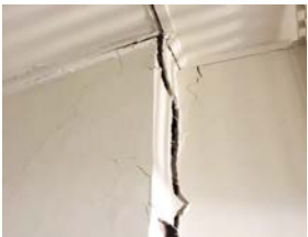
Excessive cracking and movement to internal wall