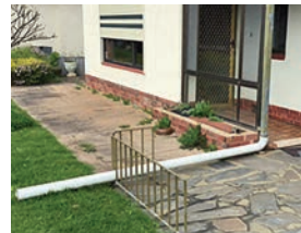
External downpipe incorrectly installed